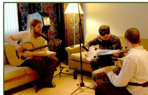
CSWR residents performing at the Meditation Room dedication