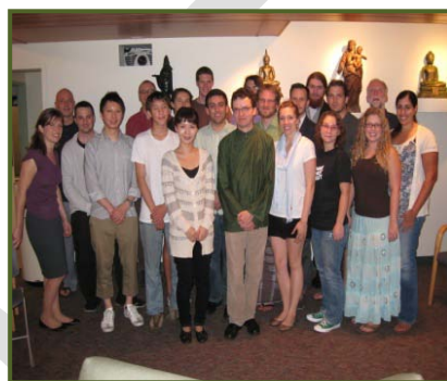
CSWR Residents 2010-2011

We will be grateful for your generosity, if possible, in support of the kinds of projects mentioned at our website. Please be in touch if you have questions or ideas in this regard too.