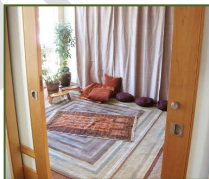
CSWR Meditation Room

I am particularly happy to mention too the opening of our Meditation Room (on the front left end of the building), where in recent decades the Directors have had their office. We are still learning how to make best use of the space at our busy university and school, but I think it has already done us good, making a statement about ourselves and our values.