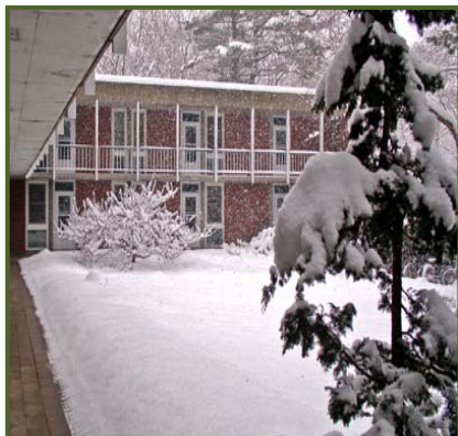
CSWR courtyard in snow

The Center building has been well maintained over the years and is in excellent condition, but this fall was an opportunity to freshen it up: new carpets in the hallways and Common Room, repainting of the Common Room and plans for new artwork on the walls in that room. We have also enhanced our art collection , with a Muslim Prayer Rug, some icons, and a lovely piece of calligraphy of the opening verses of the Song of Songs in Hebrew. The Madonna that originally graced the 3 rd Floor Meditation Room is now aptly at home in the Common Room. We have also been organizing Center files, and the university Archives have received as many as sixty of our boxes for proper long-term storage in a way that remains accessible to